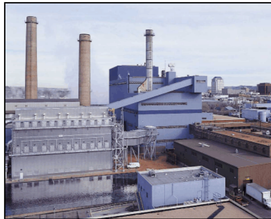
Drake Power Plant

If you are interested and able to attend this tour, please email the board at programs@apicspikespeak.org or call the APICS voice mail at (719) 578-1225. Please indicate if you prefer the morning or afternoon time.